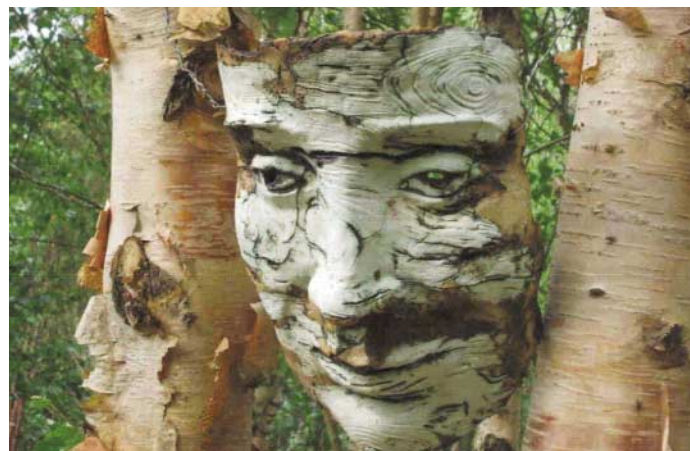
Garden Mask by Pauline Leevga (Paul Bartlett)

and we always have a good mix of media and styles. Most artists are very good at placing their work in a sympathetic location, where the backdrop of shrubs and stems both isolates