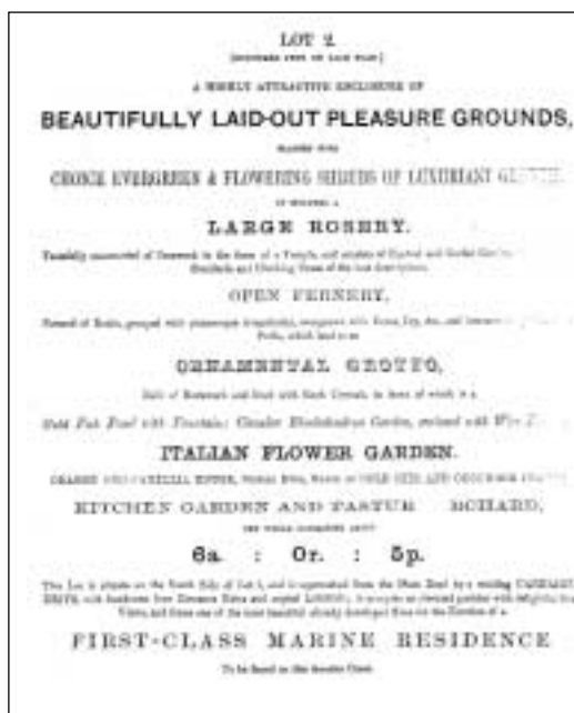
From the sale catalogue 218/77 Knowle, Sidmouth, 2 July 1880